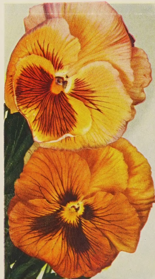
Clarkes' Pastel Hybrids—These represent only two of many shades in the mixture. Several more are illustrated on the next page.